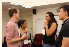
Small to medium groups